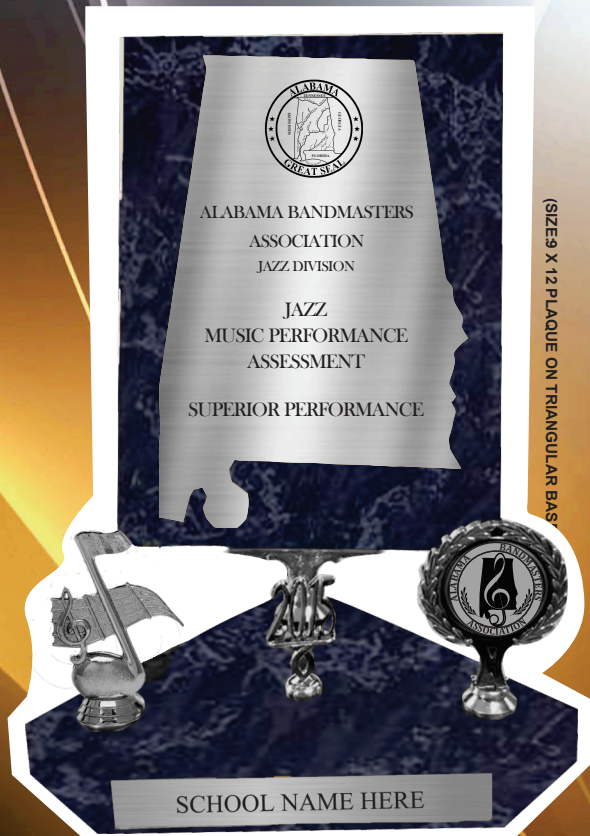
(SIZE: 9 X 12 PLAQUE ON TRIANGULAR BASE)