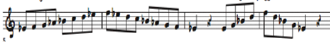
Eb Major Arpeggio