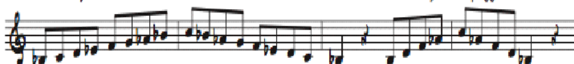
Bb Mixolydian Arpeggio