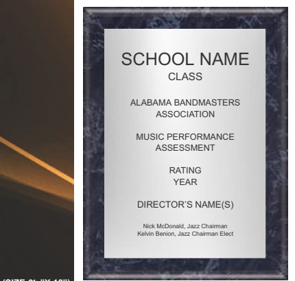
(SIZE: 9 1/2" X 12")

Please fill out form to be able to receive your ABA Award. Please PRINT NEATLY to be sure everything will be spelled correctly.