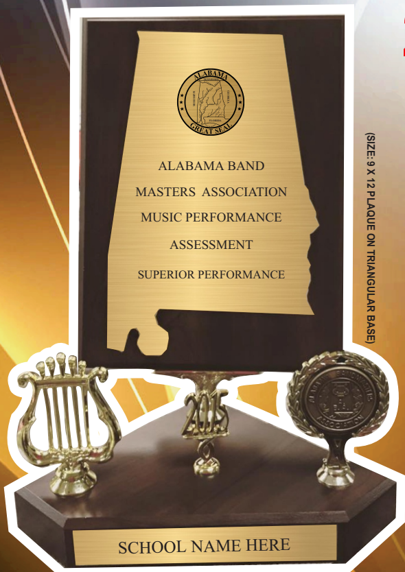
(SIZE: 9 X 12 PLAQUE ON TRIANGULAR BASE)